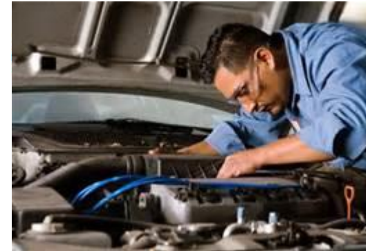
Automotive Service Excellence

To know that we’ve HELPED a customer apply some leverage in their current status brings us relief knowing that another customer can move forward successfully.